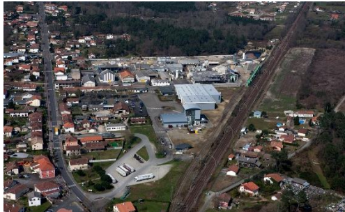
Rion des Landes plant

Subsidiary of Arkema group, MLPC International is located in the Landes region for 80 years. Thanks to its expertise in the chemistry of carbon disulfide and amines, it is now a world leader in the production of vulcanizing agents used for the largest part in the rubber processing market, but also for synthesis intermediates for agrochemicals and other specialties. With its plants in Rion des Landes and Lesgor, MLPC International is a major player in the chemicals industry of the Landes region. We have one of the best export sales rates, with 87% of its products going to industries around the world.